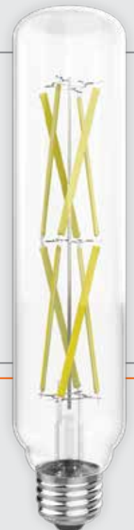
T40 Filament VO-FT40W9-26